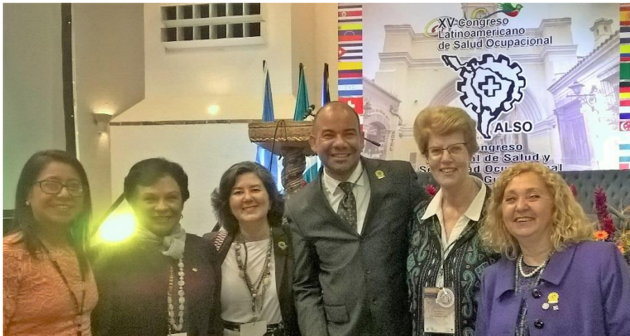
Fig. 1. Speakers in Latin American Seminar in Woman, Health & Work in Guatemala

Finally, we would like to express our gratitude to the ICOH officers for their unconditional and valuable support to our efforts to achieve these results.